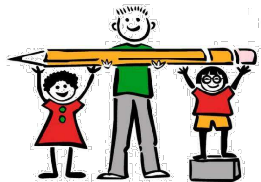
Figure 2 Inheritance of excellent traditional culture

Students in colleges and universities are the object of education, and the improvement of students' quality in education directly reflects the effect of integration into education. In the process of carrying out integration into education, colleges and universities should take students as the fundamental, adhere to "teaching students according to their aptitude" and "camera selection method ", truly inherit excellent traditional culture and improve students' moral education quality. As Zhu Xi said, in the process of education "because of its material ", we should achieve the teaching goal of" preaching "and" solving doubts ", as shown in figure 2. Therefore, in the process of carrying out integration education in colleges and universities, we should not only respect teachers, but also emphasize student-based education.